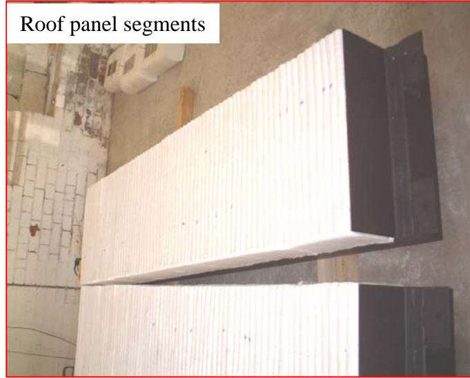
Roof panel segments

Steel frames made from 150x50x6mm hot rolled channel section, with ambideck flooring inside channel frame supporting fibre linings.