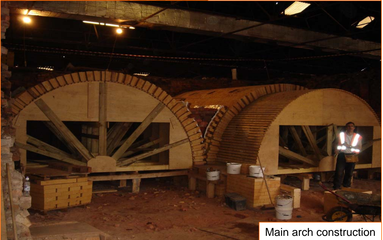
Main arch construction