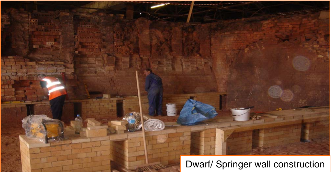
Dwarf/ Springer wall construction

Industry: Traditional Chamber/ Hoffman Kiln Location: UK Operating Temperature: 1200°C Scope of Works: Complete thermal redesign & rebuild of two chambers