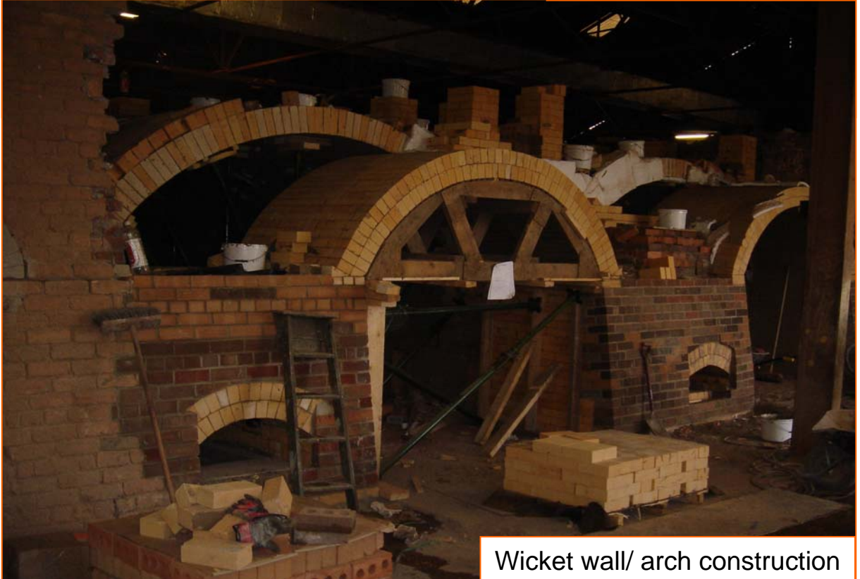
Wicket wall/ arch construction