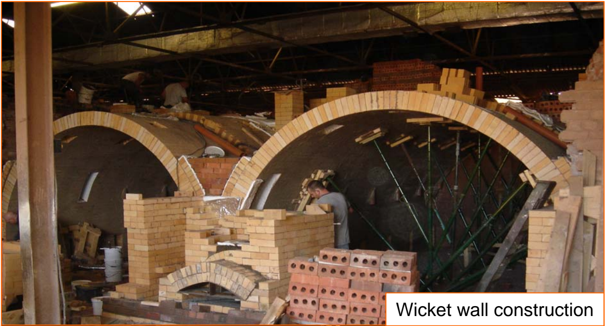
Wicket wall construction

Industry: Traditional Chamber/ Hoffman Kiln Location: UK Operating Temperature: 1200°C Scope of Works: Complete thermal redesign & rebuild of two chambers